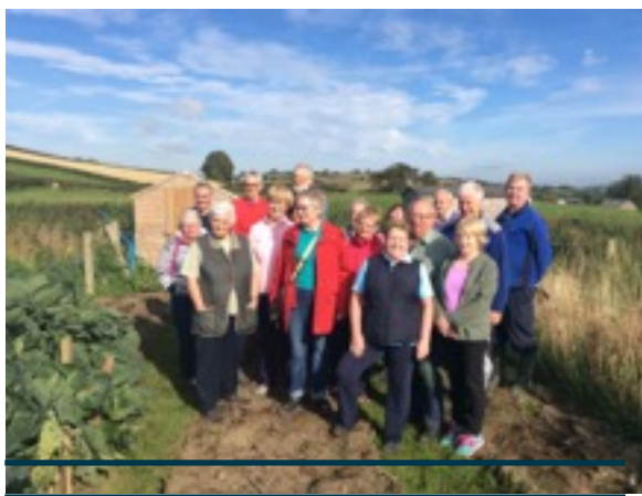
Listen and learn