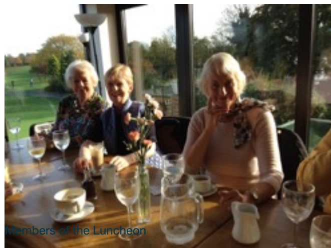
Members of the luncheon group met at Lurgan Golf Club Restaurant

A group of twelve members enjoyed the October luncheon meeting at Lurgan Golf Club. Those attending the dinner agreed the November meeting should take place in Brownlow Castle.