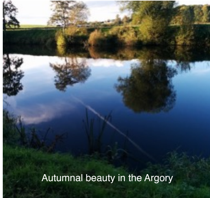
Autumnal beauty in the Argory