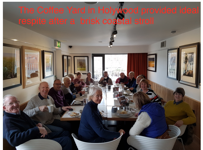
The Coffee Yard in Holywood provided ideal respite after a brisk coastal stroll