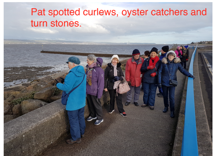
Pat spotted curlews, oyster catchers and turn stones.