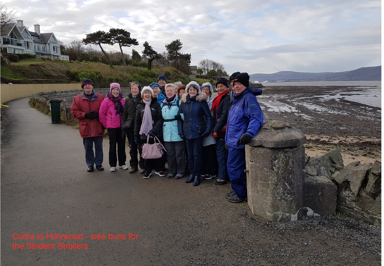
Cultra to Holywood - wee buns for the Strident Strollers