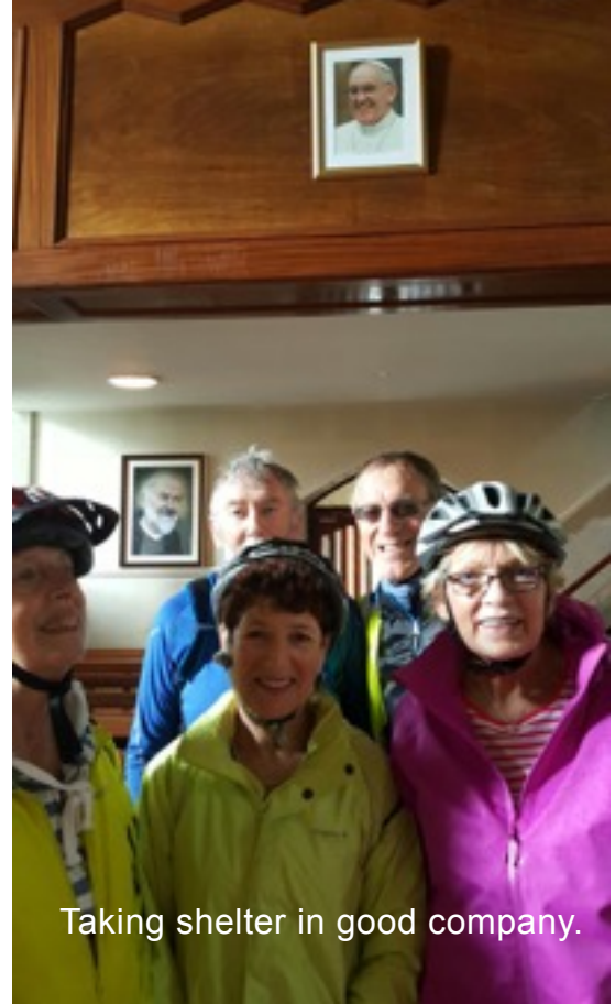
Taking shelter in good company.

It's My Procedure, and I'll Cry If I Want To