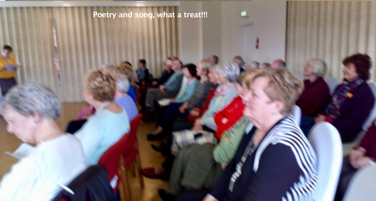
Poetry and song, what a treat!!!